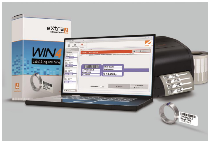
Fig. 1: Label printing software now available as main release 'eXtra4-win4'